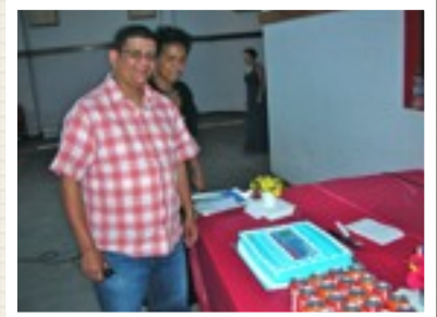
CAKES ARE READY