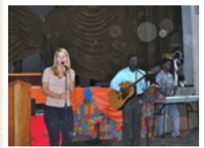
MUSIC FOR ALL