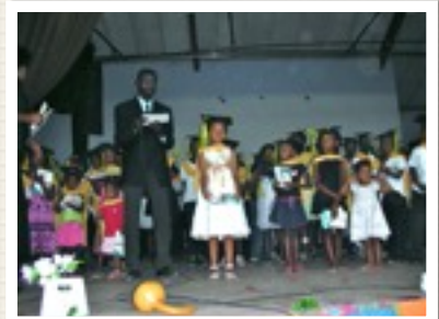
ALL AGES BLESSED