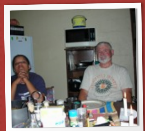
SOME GOODIES CHILLIN'