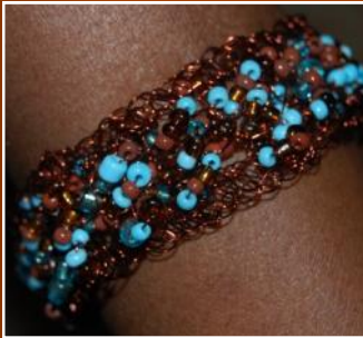
Copper Beaded Bracelet $10 USD (5 hours)

All profit goes straight to the crafters.