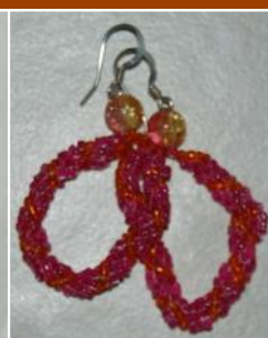
Loop Earrings $6-00 USD (4 hours)