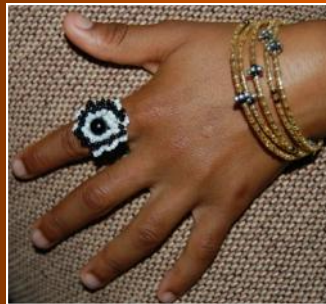
Burst Ring & Bracelet Set $8 USD (4 hours)