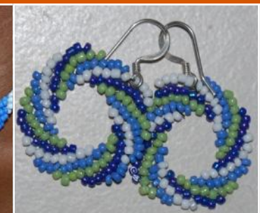
Spiral Earrings $6.25 USD (4 hours)