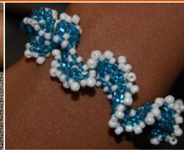
Benguela Wave Bracelet $6.50 USD (3 hours)