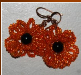
Flower Earrings $3.50 USD (2 hours)