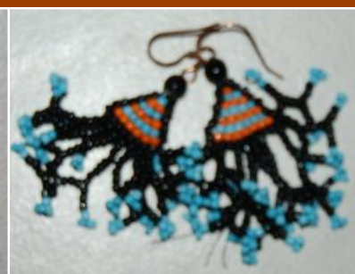
Night Dance Earrings $7.30 USD (6 hours)