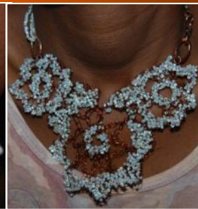
Splash Necklace $21 USD (10 hours)