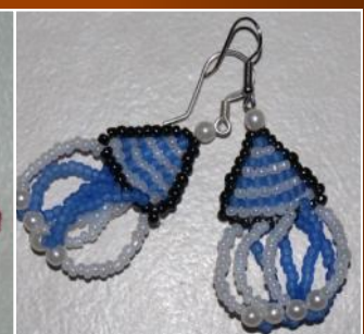
Water Dance Earrings $6.00 USD (4 hours)