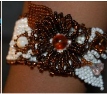
Flower-Beaded Bracelet $17.50 USD (8 hours)