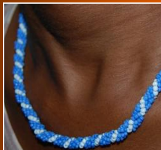
Cyclone Necklace $13 USD (8 hours)