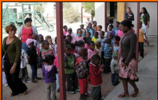
First Day of School for 2011 at TKCA