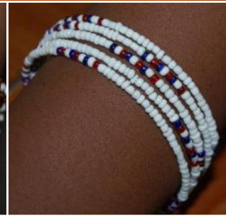
Striped Bracelet $3.50 USD (1 hour)