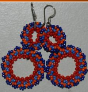
Double Spiral Earrings $6.50 USD (4 hours)