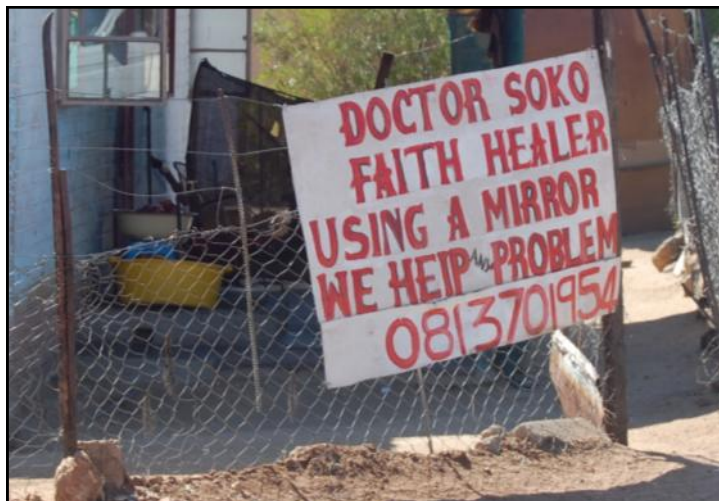
False messages of hope only make the situation worse (This sign can be found soon after entering the township area.)

There is HOPE. There always is. Finding ways to get the message of hope out there proves a difficult task with all the competing messages of hatred, division, and competitiveness. Please pray for us as we step into spiritual and relational territory that has been "war-torn" for decades, and as we attempt to be restorers of broken walls (see Isaiah 58:12).