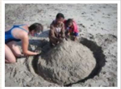
CASTLE W/ MOAT