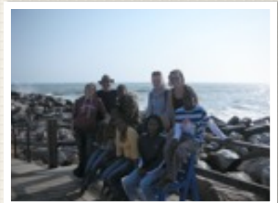
BEACH DAY TWO