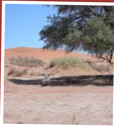
TOUR GUIDE EXPLAINS EVENTS