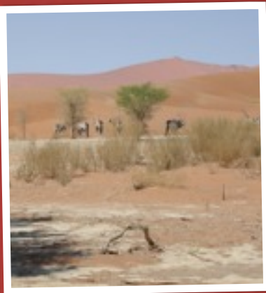
ROAD TO SOSSUSVLEI GREETERS

term missions. People who come, come to work with the children, and because of that, they are predominately women who do this. I would ask men who are retired, to consider coming to help with the mentoring of these kids from the male perspective.