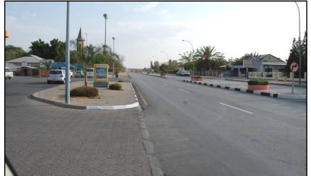
Parts of Otjiwarongo are very modern...