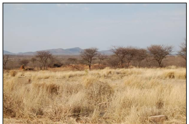
Outside the town are vast rural farm areas.