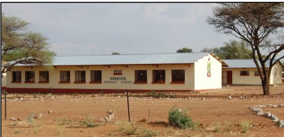
Donatus Primary School

So far we have received acceptance letters for 8 of our children, and still are praying for spaces for up to 8 more placements. We have had some changes in our plan recently because one foster father received word that he was hired on a “permanent” basis at one of the mines around Arandis. This is good news for him, because it has been quite a long time since he has held a job, but it also means that the family must stay put there in Arandis. The high school aged children will still come and stay with one of our other foster families so they can receive a good high-school education.