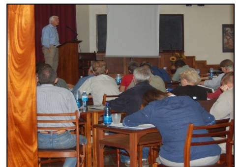
The AIM Leadership Workshop (main meeting room)

The Leadership Workshop was a mix of updates from the different regions; teaching on topics such as servant leadership, leadership in crisis situations, and having difficult conversations; as well as "business" times where we hashed out a Vision and Strategy Paper for the Unit in Namibia that can be used at our offices worldwide to help recruit and mobilize future