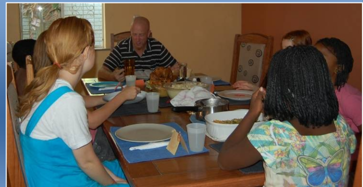
Thanksgiving Devotional Time – before dinner

We had a wonderful time together as a family on Wednesday (we celebrated 1 day early because of a planned trip to Windhoek).