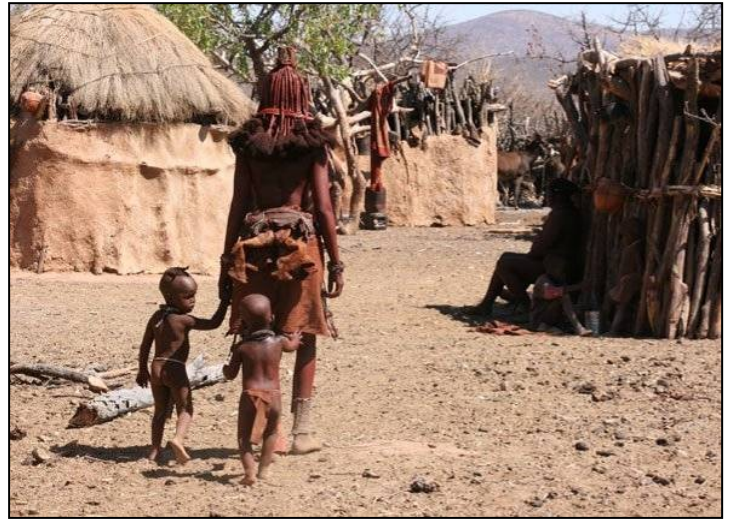
Himba village near Opuwo, Namibia