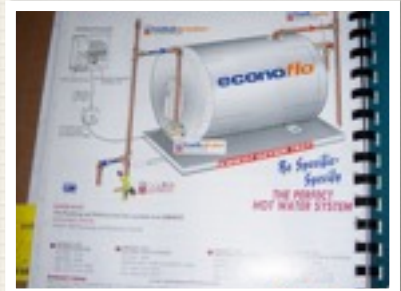
TYPICAL ELECTRIC GEYSER