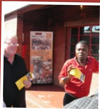
TOUR GUIDE EXPLAINS EVENTS