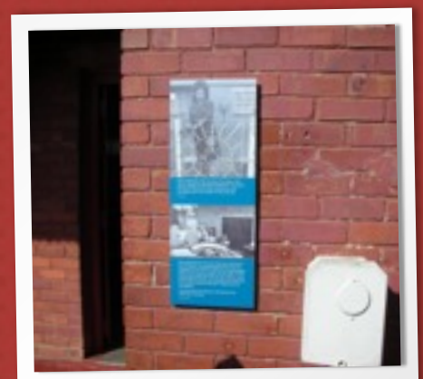
PICTURE OF WINNIE MANDELLA