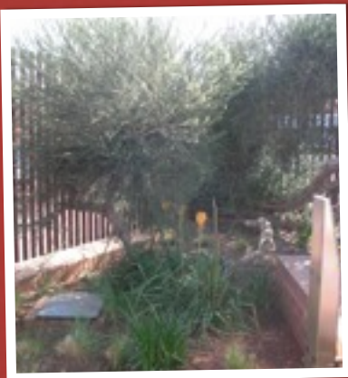
UMBI TREE AT MANDELLA HOUSE

We would be much closer to the 'Kingdom' than we are at present.